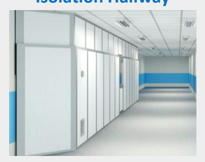
Ideal for providing containment across multiple rooms and areas