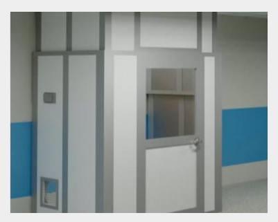
Sets up in minutes with no dust or debris