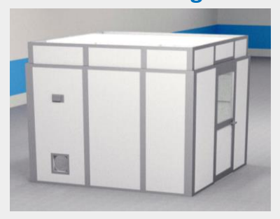
Ceilings offer options for free-standing rooms or corridor tunnels