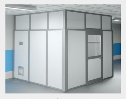
Suitable space for multiple medical personnel